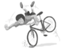
(he / ride / a bike)