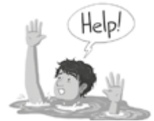
(he / swim)