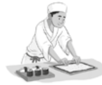
(he / make / sushi)