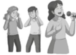
(she / sing)